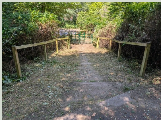
Cleared entrance to A24 green gate

Some recent work carried out at the Ashted Park work party.